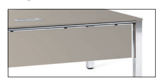
Update. High quality furniture requires cable outlets of superior design.

Privacy. Coordinated with the table top finish, the modesty panel provides an attractive screen along the front of the desk.